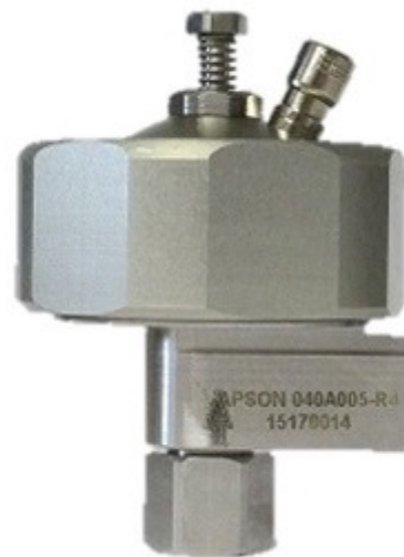
Fig. 1: APSON Lacquer Pressure Regulator PRP-2023-R

The APSON Lacquer Pressure Regulator PRP-2023-R is a pneumatically controllable and backwards flushable flow-through regulator for aggressive viscous media, e.g. paints, solvents, alkalis, a.o. Because of the design, it allows before the flushing process to recover medium , not only by pushing forward, but also by pushing medium backwards. This regulator type is optimized for good rinsing barness and small solvent consumption. Therefore it is particularly suitable to the employment in automatic systems.