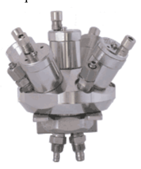
APSON 2C Switching Block XMY-2009 HB with Backpropagation

This type of switching block is particularly suitable to the employment in automatic coating systems with often to change chemically aggressive media, e.g. lacquers, hardeners, solvents, caustic solutions, a.o. It is applicable both for 2C normal lacquers and 2C metalic lacquers.